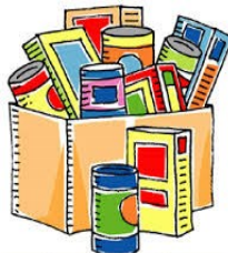
Feeding the Community

You are also welcome to bring items to the church anytime during the weeks prior.